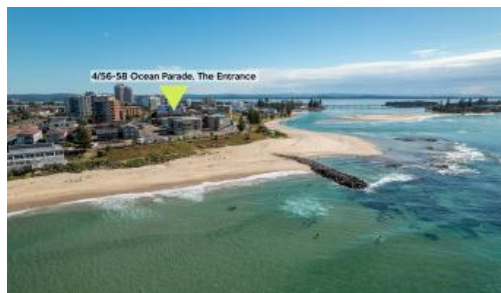
4/56-58 Ocean Parade, The Entrance