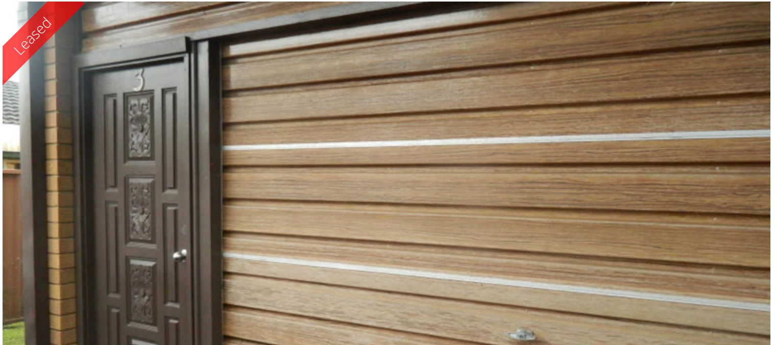
3, 23 Fairview Avenue, The Entrance