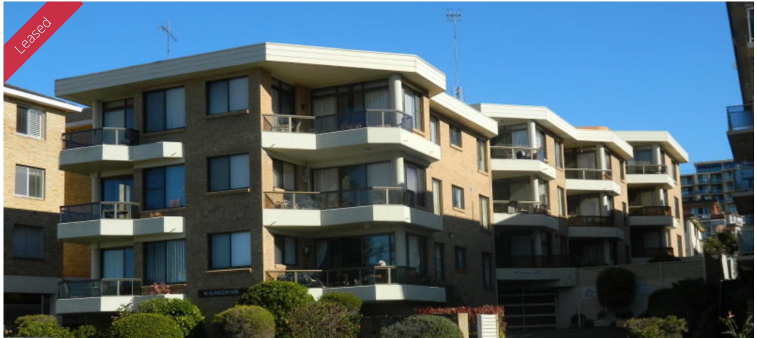
Unit 3, 10 Marine Parade, The Entrance