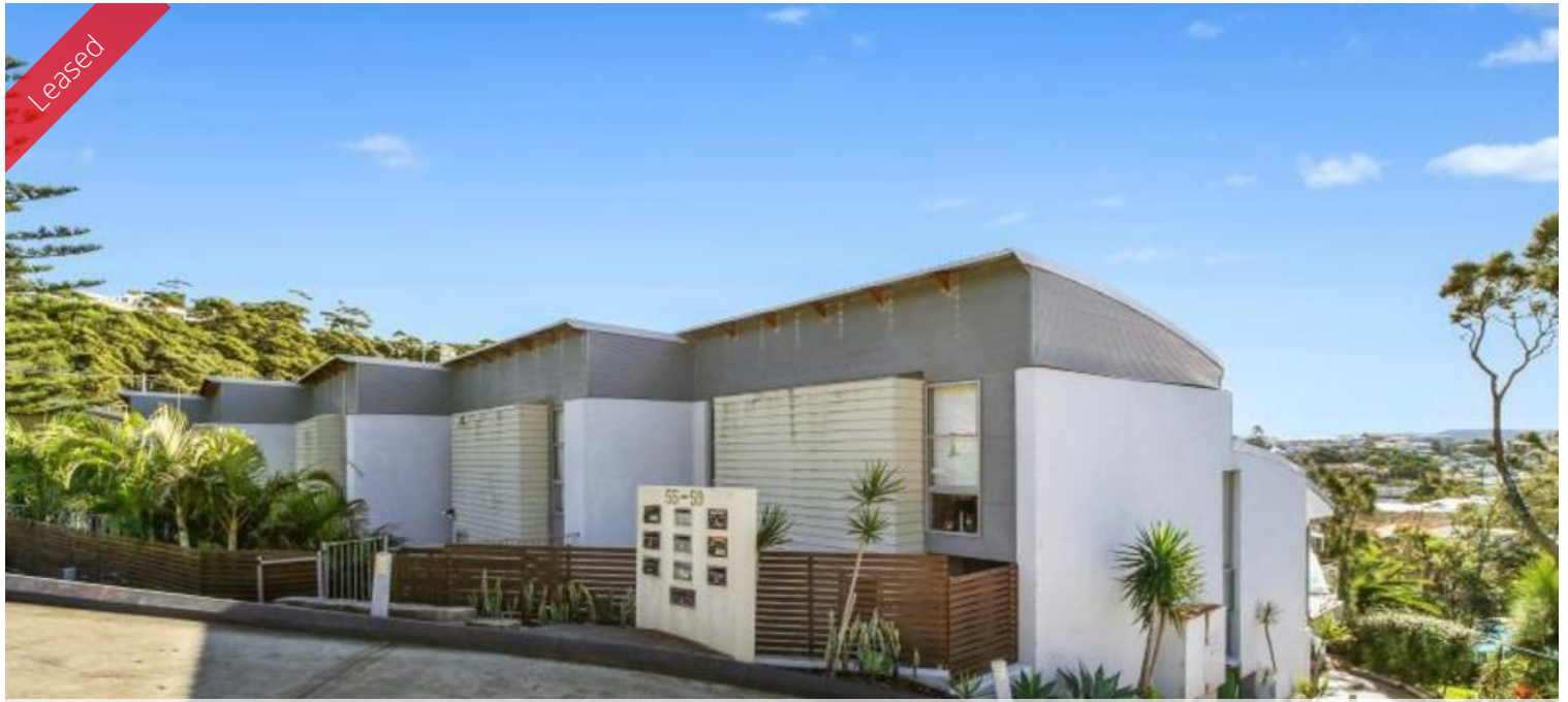
Unit 7, 55-59 Scenic Hwy, Terrigal