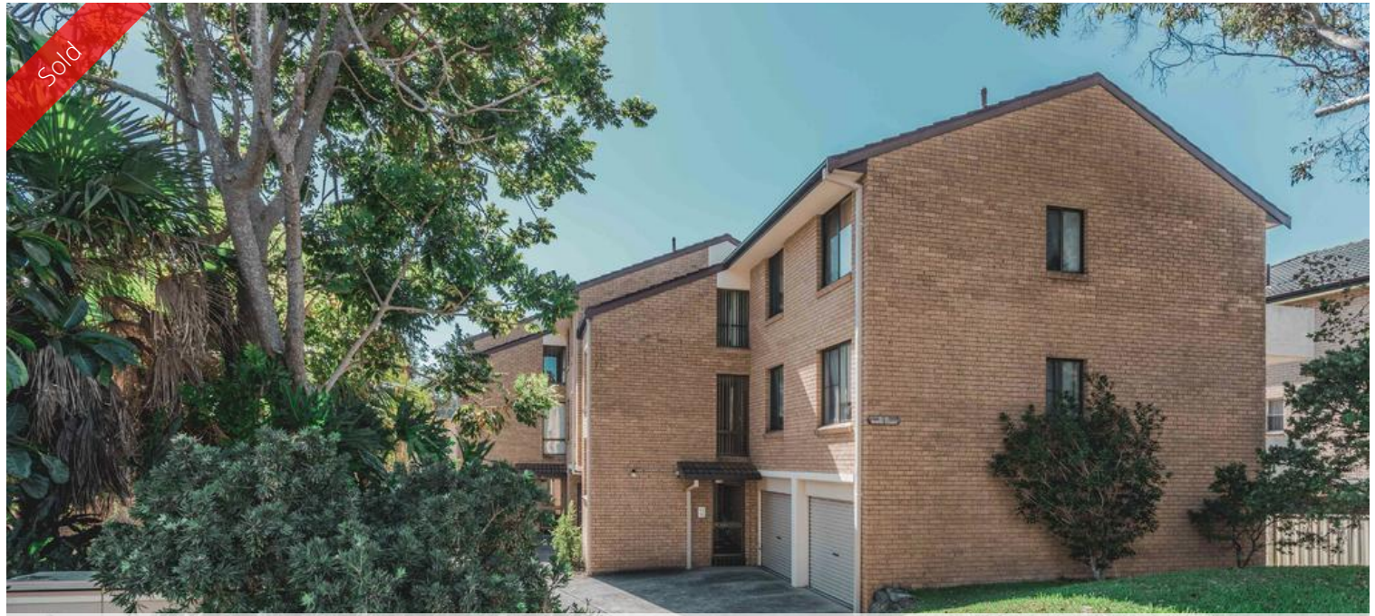
Unit 1, 8-12 Ocean Pde, The Entrance